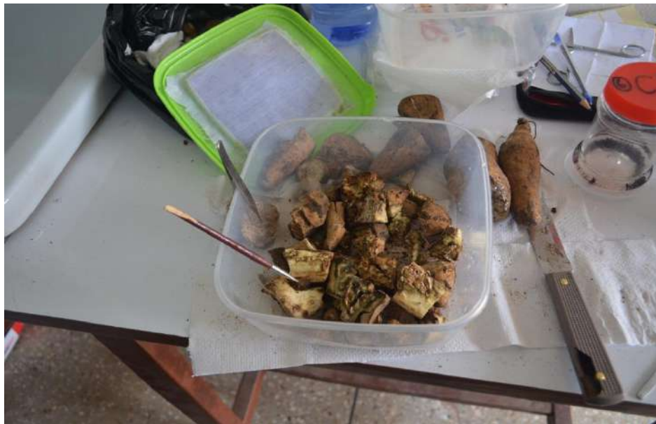
Figure 2: (a) and (b) Incubation of infested tubers