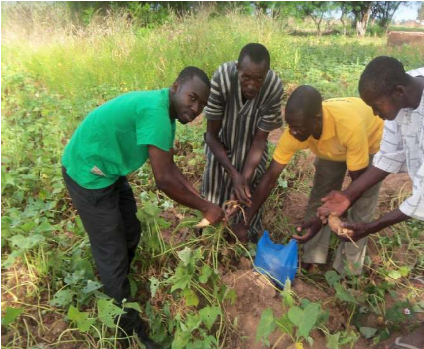
Figure 1: Field collection

The infested were introduced into envelopes and labeled as follows: