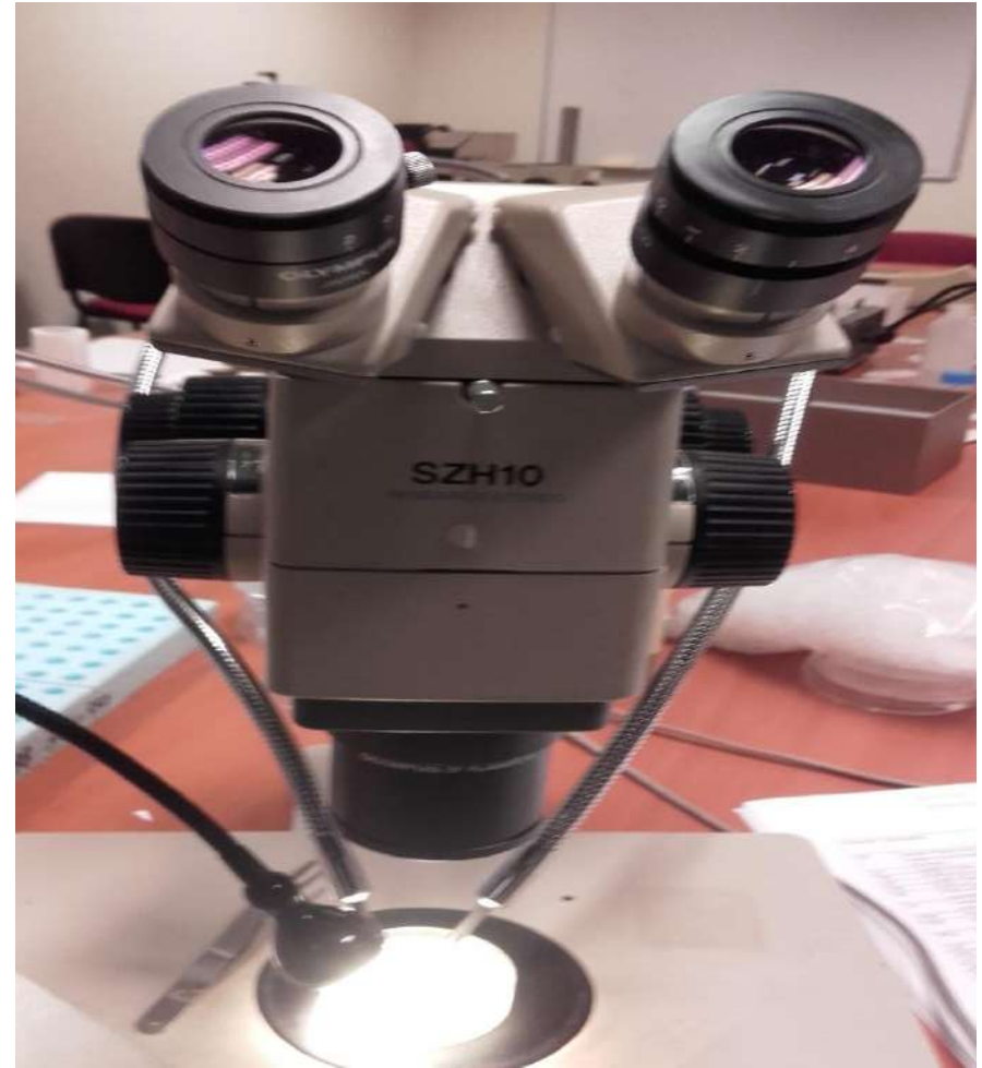
Figure 5: Binocular microscope

14 characters from all parts of the body of male and female specimens were measured using an ocular micrometer attached to a binocular microscope.