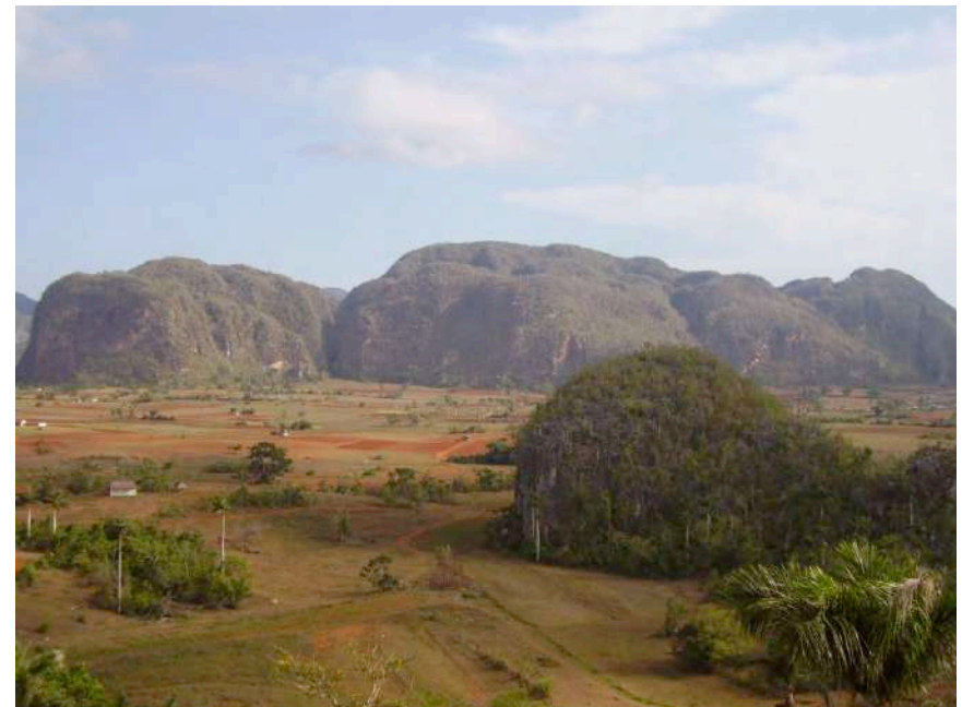
Viñales National Park