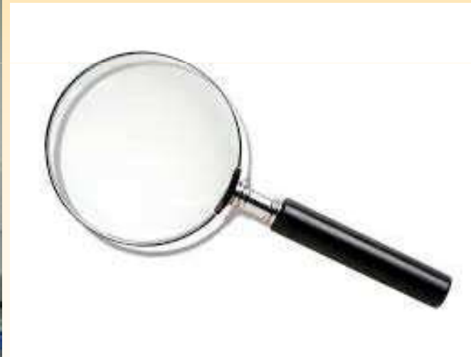
Figure 3: Part of instruments used