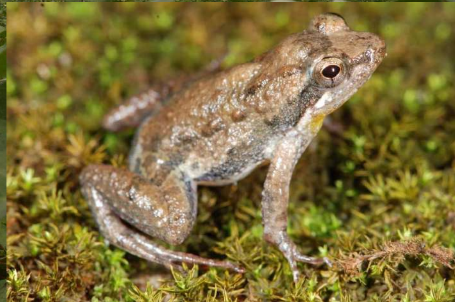
Figure 7: A. maculatus and P. latifrons